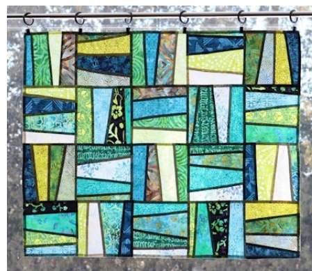
Stained glass window hanging - Epida Studio