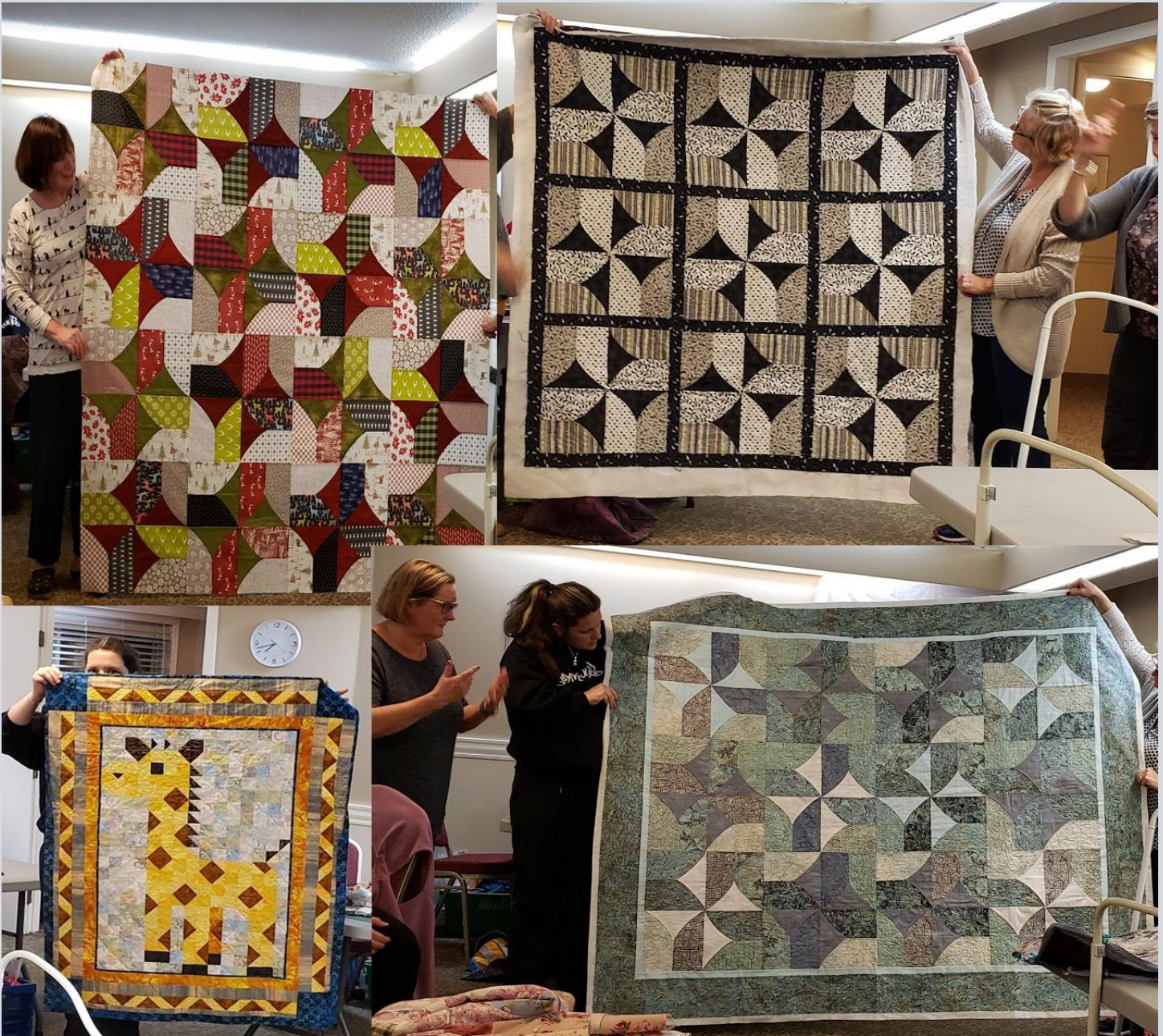
“...if you can’t fix it, feature it!”